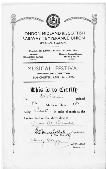
1927-1956, Fenton Ladies Choir, correspondence and papers, KC33/1/012, Kirklees (GB 204)