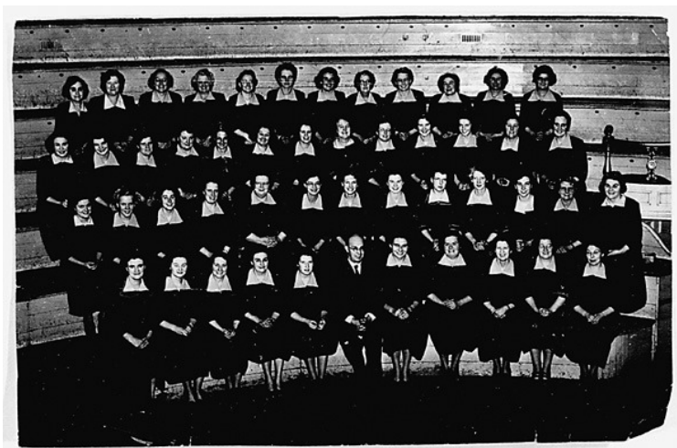
1927-1956, Fenton Ladies Choir, correspondence and papers, KC33/1/031, Kirklees (GB 204)